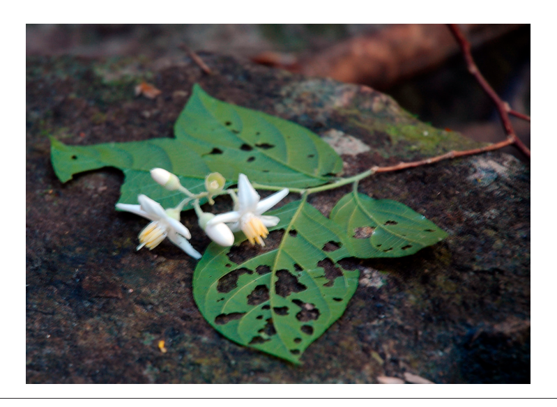
Fig. 2. Flowering branchlet of Styrax cambodianus.