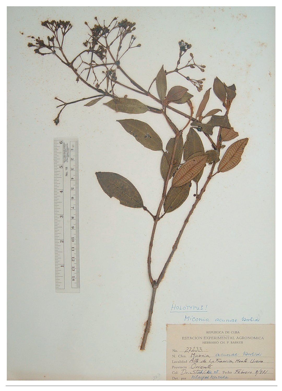
Fig. 2. Holotype of Miconia acunae (at HAC); note large inflorescence and rather small leaves, each with four secondary veins (two inconspicuous and intramarginal) and a cuneate or rounded base.