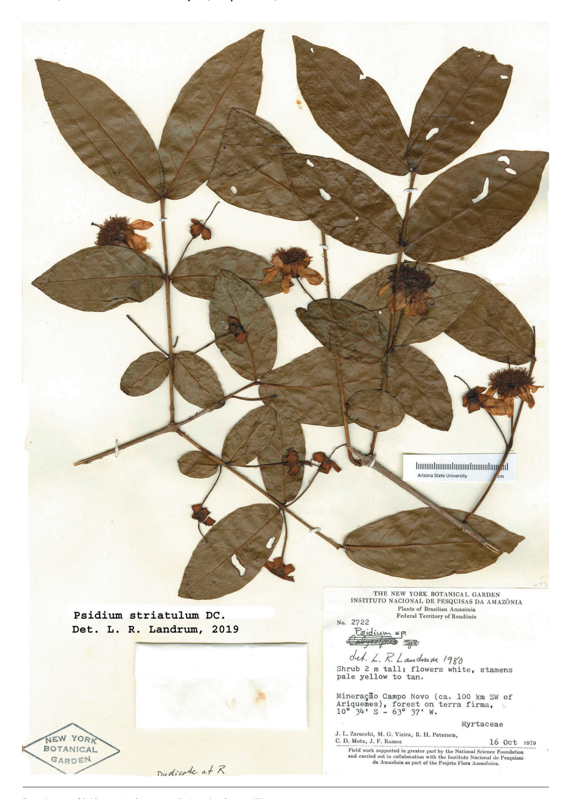
Fig. 3. Isotype of Psidium striatulum var. rondoniense Landrum at NY.