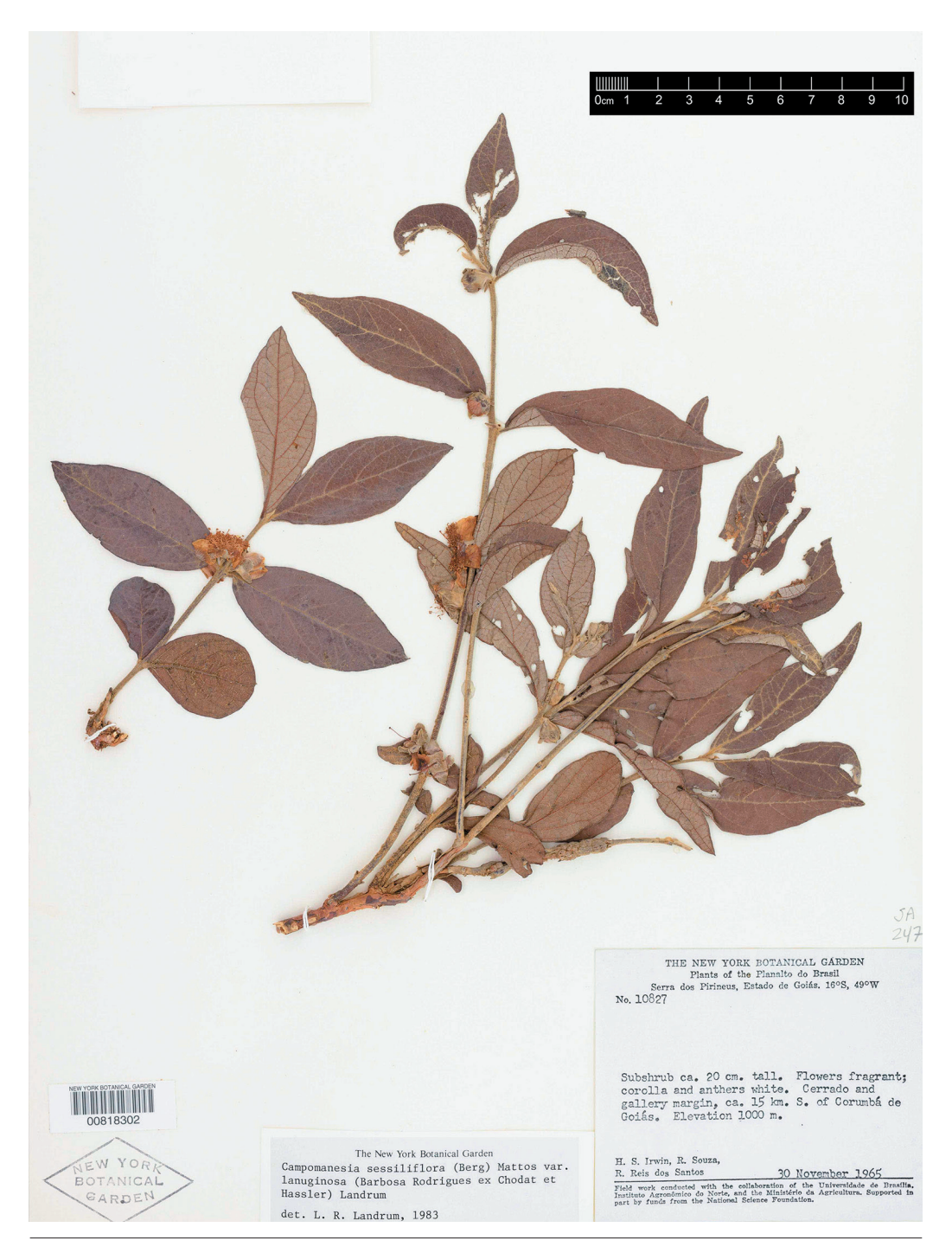
Fig. 2. Isotype of Campomanesia sessiliflora (O. Berg) Mattos var. lanuginosa Landrum at NY.