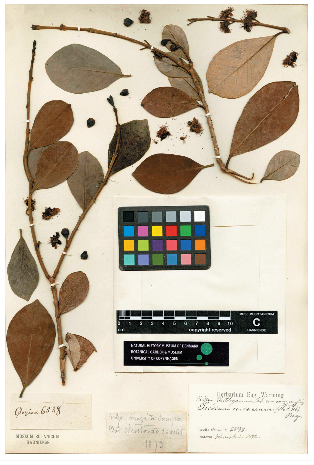
Fig. 5. Lectotype of Psidium cattleyanum var. coriaceum Kiaerskou, Glaziou 6538 at C.