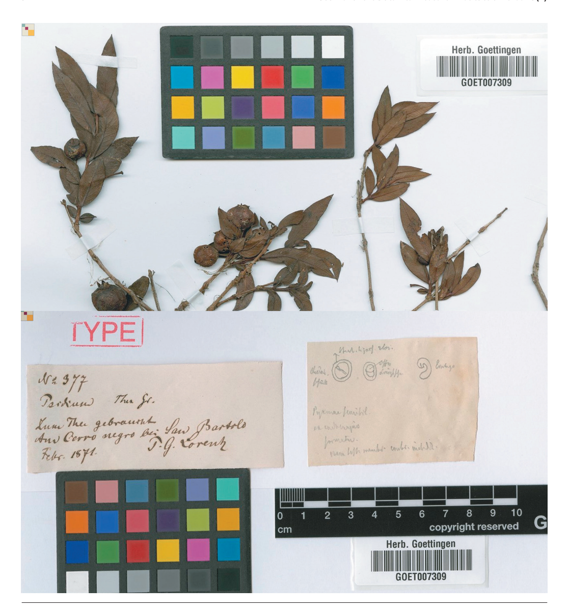
Fig. 6. Upper and lower portions of lectotype of Griseb., Lorentz 377 at GOET.

The basionym, Psidium coriaceum , of this new combination was illegitimate, being superfluous, because Berg cited another older name ( Psidium humile Vell., Fl. Flumin. 211, 1829) as a synonym. Under the International Code of Nomenclature (Turland et al. 2018) article 58.1, "If there is no obstacle under the rules, the final epithet in an illegitimate name may be re-used in a different name, at either the same or a different rank ... the resulting name is then treated either as a replacement name with the same type as the illegitimate name or as the name of a new taxon with a different type."