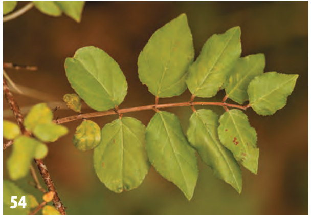
FIG. 50. Oplismenus setarius . FIG. 51. Potamogeton illinoensis . FIG. 52. Rhynchospora microcarpa . FIG. 53. Rhynchospora odorata . FIG. 54. Sageretia minutiflora .