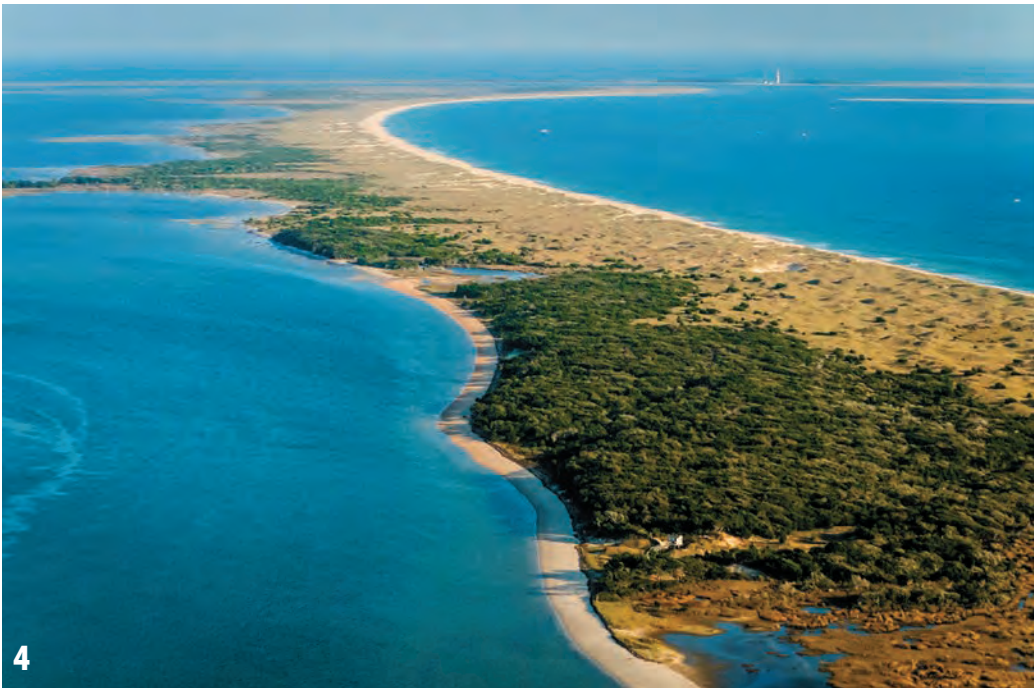
FIG. 3. Nags Head town, with dune of Jockeys Ridge State Park (back left) and Nags Head Woods Preserve (back right). FIG. 4. Shackleford Banks with Cape Lookout Lighthouse in far back.