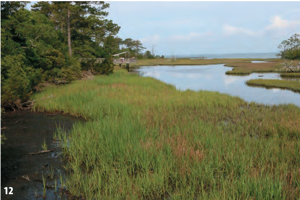
FIG. 11. Tidal Freshwater Marsh Cattail Subtype, Bodie Island. FIG. 12. Brackish Marsh, Bogue Banks.