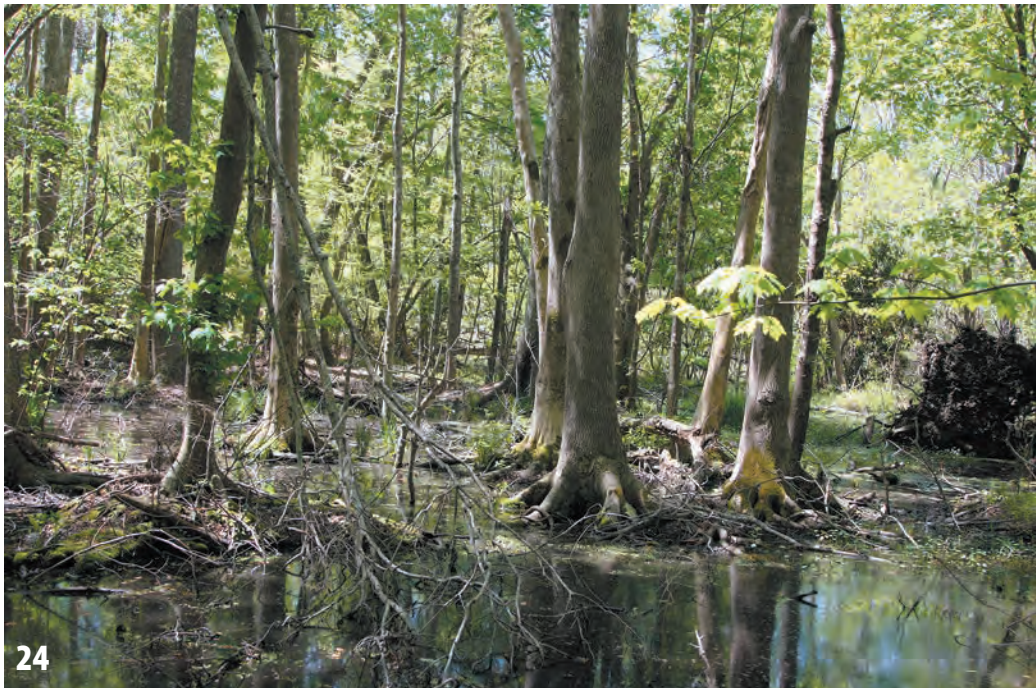
FIG. 23. Maritime Shrub Swamp, Buxton Woods, with Carpinus caroliniana (left) and Nyssa biflora (dead tree and right). FIG. 24. Maritime Swamp Forest, Kitty Hawk Woods, with Nyssa biflora and Acer rubrum .