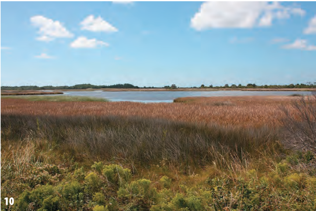
FIG. 9. Flooding on Ocracoke Island. FIG. 10. Tidal Freshwater Marsh with pond, Bodie Island.

This document is intended for digital-device reading only. Inquiries regarding distributable and open access versions may be directed to jbrit@brit.org .