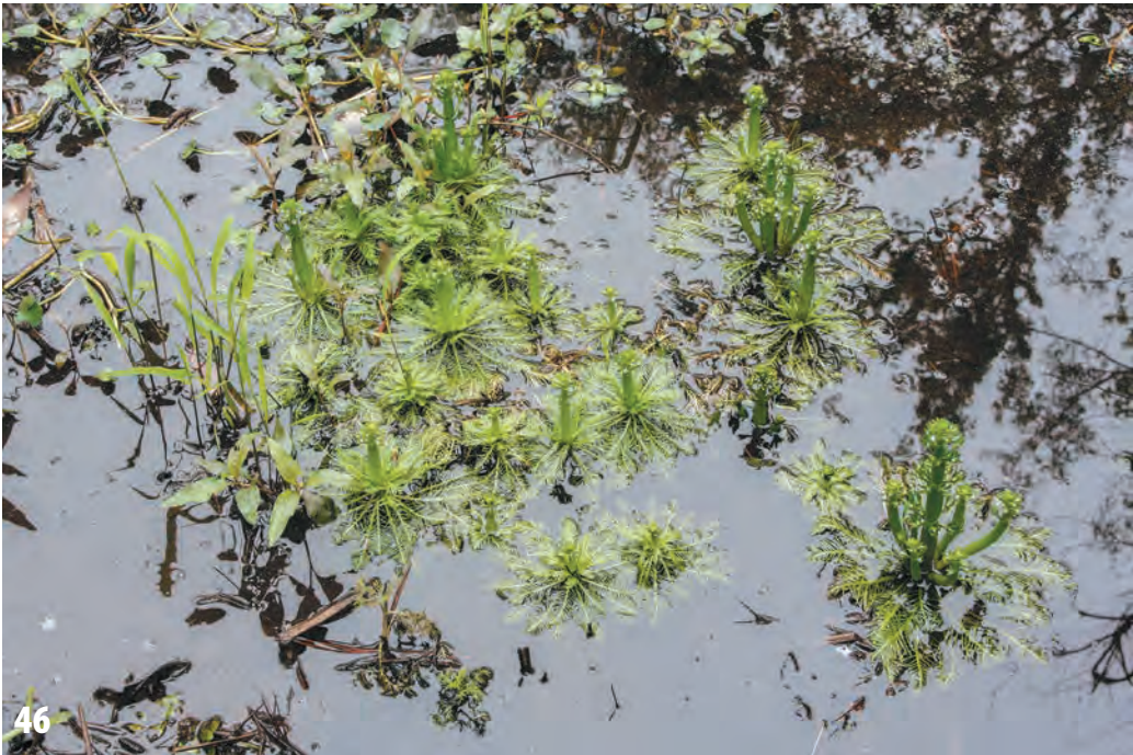
FIG. 45. Hibiscus aculeatus . FIG. 46. Hottonia inflata .