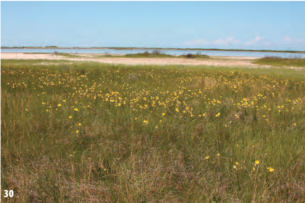
FIG. 29. Maritime Wet Grassland, near Cape Hatteras Point, with Muhlenbergia sericea and Juniperus virginiana . FIG. 30. Maritime Wet Grassland, Pea Island, with Oenothera unguiculata .