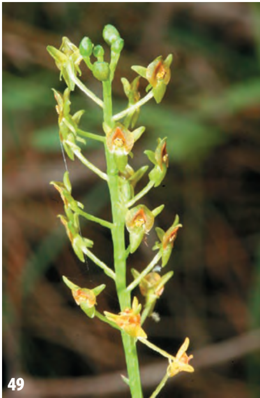
FIG. 47. Hudsonia tomentosa . FIG. 48. Ipomoea imperata . FIG. 49. Malaxis spicata .