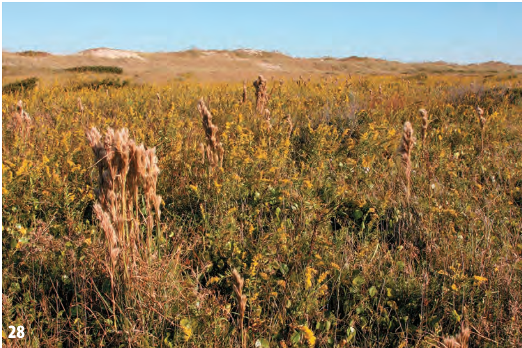
FIG. 27. Maritime Dry Grassland, near Hatteras village. FIG. 28. Maritime Wet Grassland, Pea Island, with Andropogon tenuispatheus and Solidago mexicana .