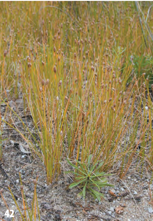
FIG. 39. Dichanthelium caeruleum . FIG. 40. Dichanthelium neuranthum . FIG. 41. Eleocharis cellulosa . FIG. 42. Eleocharis montevidensis .