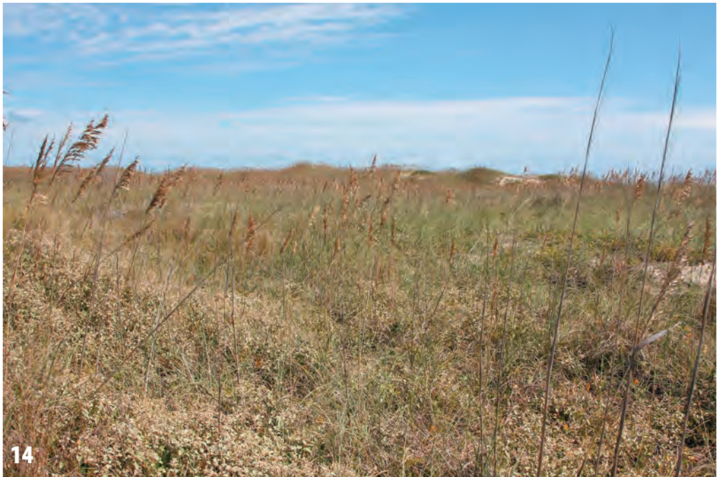
FIG. 13. Dune Grass Northern Subtype, Jockey's Ridge SP, with Calamagrostis breviligulata and Panicum amarum . FIG. 14. Dune Grass Southern Subtype, Buxton, with Uniola paniculata and Croton punctatus .