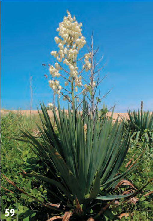
FIG. 58. Tridens chapmanii . FIG. 59. Yucca gloriosa .