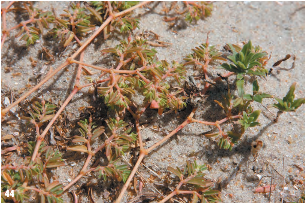
FIG. 43. Eleocharis parvula . FIG. 44. Euphorbia bombensis .