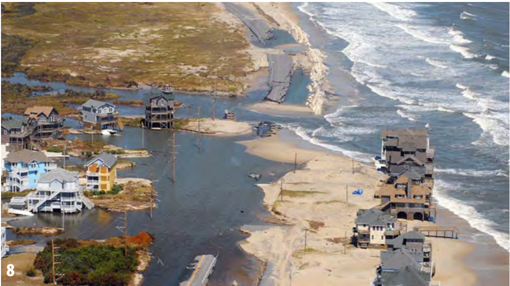
FIG. 7. Buxton Woods and Cape Hatteras Lighthouse. FIG. 8. Overwash just northeast of Buxton.