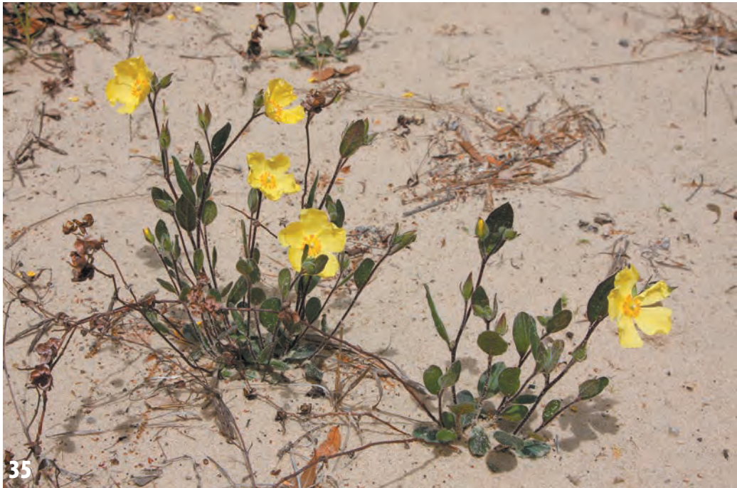
FIG. 33. Clematis catesbyana . FIG. 34. Corallorhiza wisteriana . FIG. 35. Crocanthemum carolinianum .