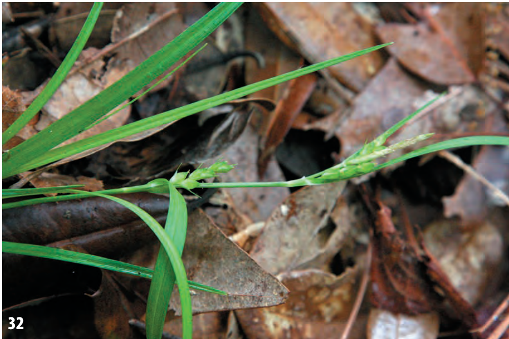
FIG. 31. Amaranthus pumilus - courtesy of Maryland BioDiversity. FIG. 32. Carex calcifugens .