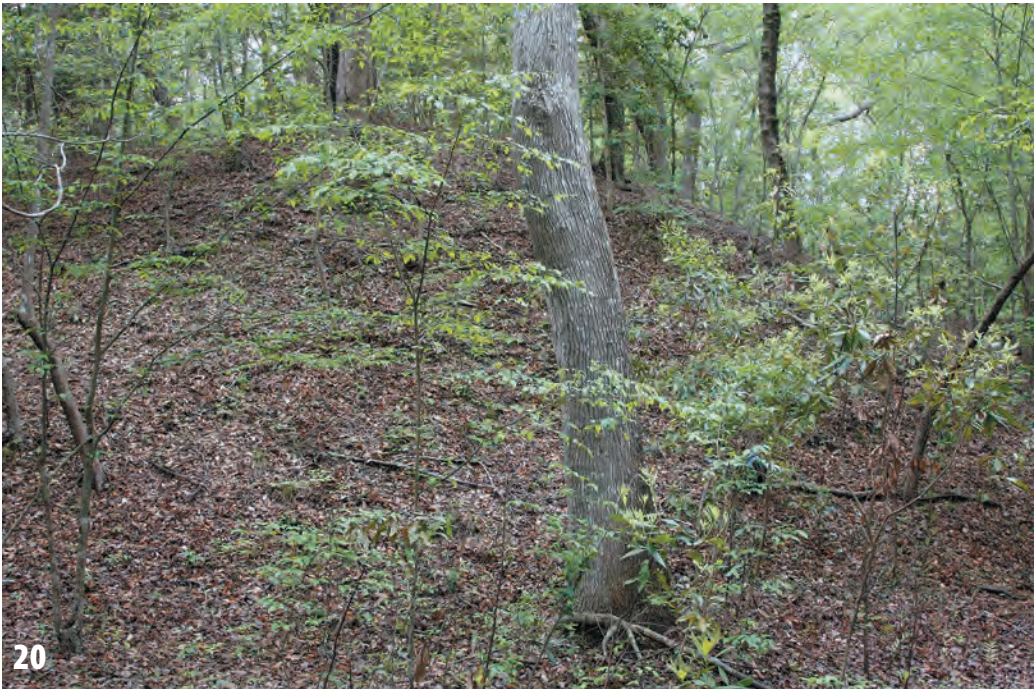
FIG. 19. Interdune Pond, Buxton, Open Pond, with emergent graminoids, floating Potamogeton illinoensis , and Typha domingensis in back. FIG. 20. Maritime Deciduous Forest, Nags Head Woods.