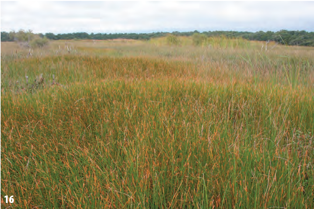
FIG. 15. Maritime Shrub Stunted Tree Subtype, Frisco. Fig. 16. Interdune Marsh, Buxton, dominated by Eleocharis cellulosa .