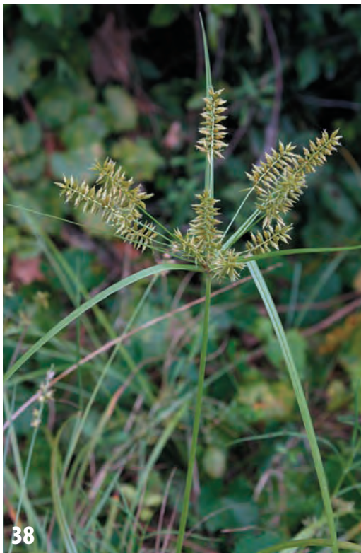
FIG. 36. Crocanthemum georgianum . FIG. 37. Cyperus surinamensis . FIG. 38. Cyperus tetragonus .