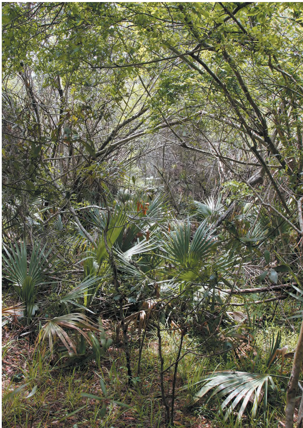
FIG. 22. Maritime Shrub Swamp, Buxton Woods, with Sabal minor and Cornus stricta .