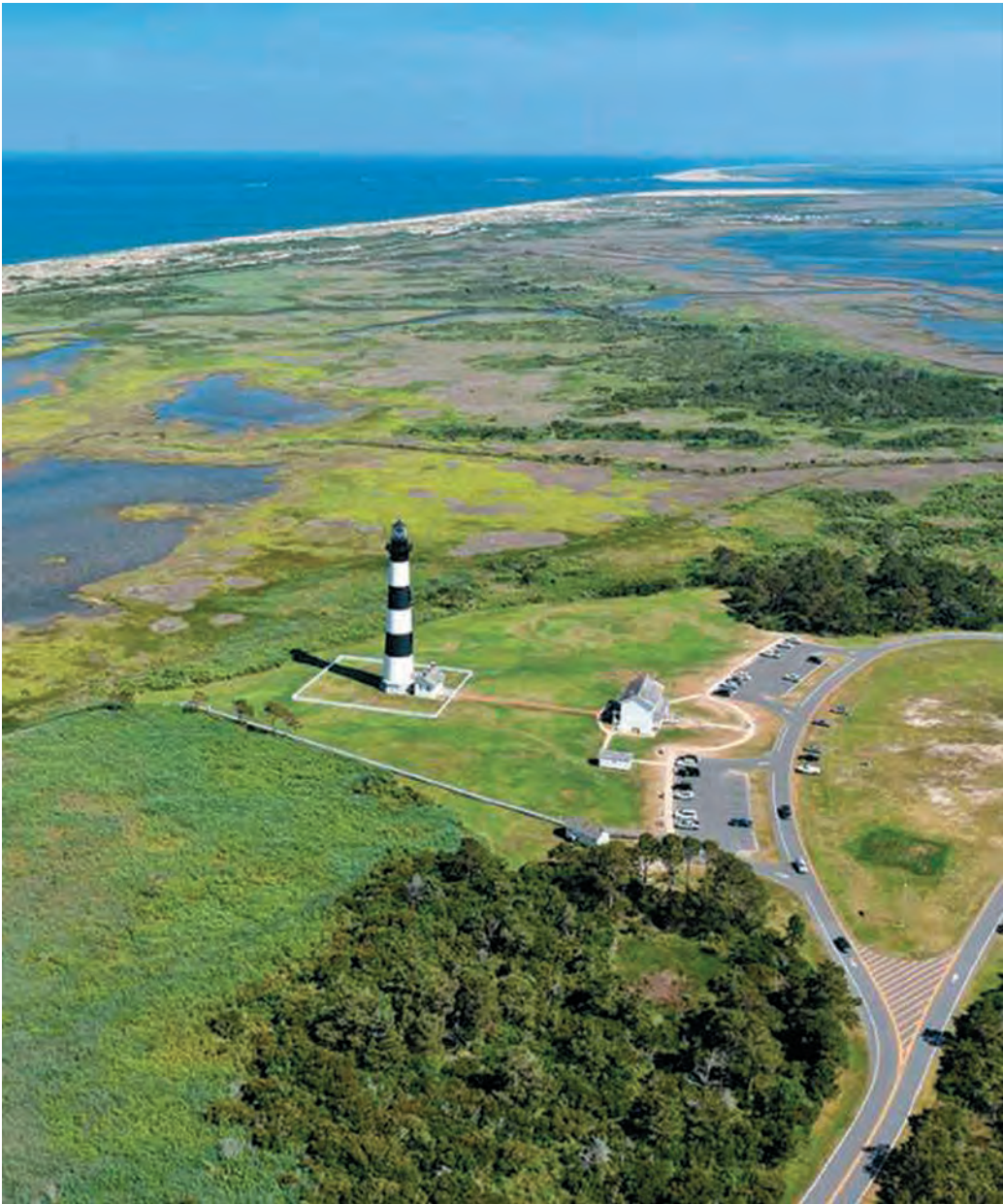
FIG. 5. Bodie Island Lighthouse and marshes.