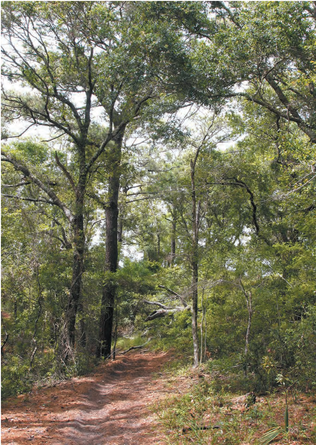
FIG. 21. Maritime Evergreen Forest, Buxton Woods.