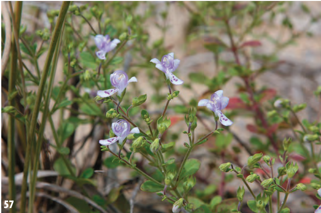
FIG. 55. Scleria verticillata . FIG. 56. Sesuvium maritimum . FIG. 57. Trichostema nesophilum .