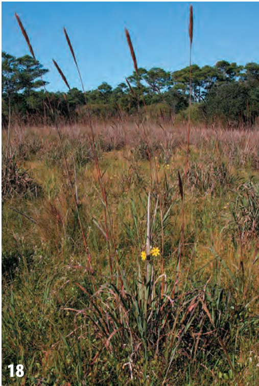
FIG. 17. Interdune Marsh, Buxton, dominated by Zizania aquatica and Salix caroliniana . FIG. 18. Interdune Marsh, Buxton, with Coleataenia rigidula ssp. condensa and Bidens laevis .