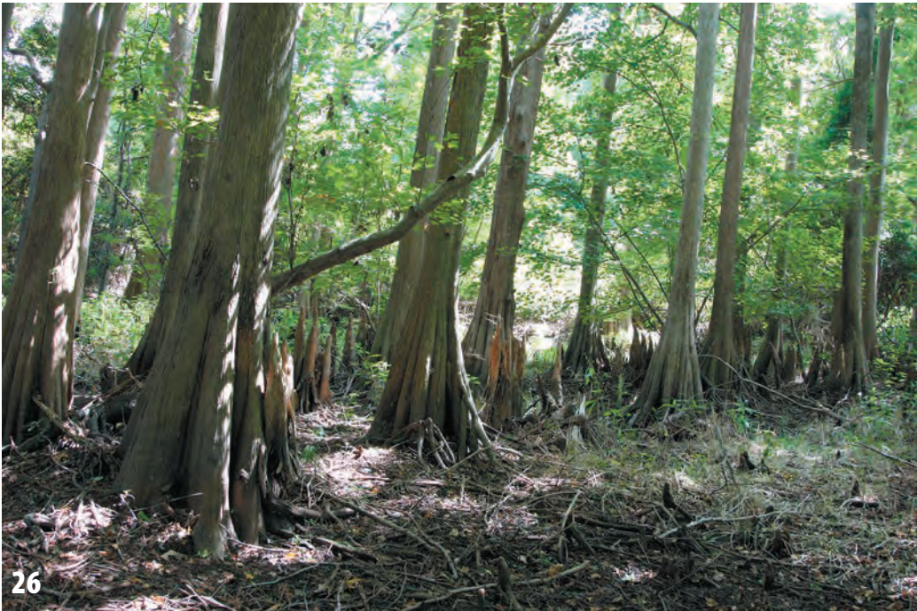
FIG. 25. Maritime Swamp Forest, Nags Head Woods, with Nyssa biflora . FIG. 26. Maritime Swamp Forest Cypress Subtype, Southern Shores, with Taxodium distichum .