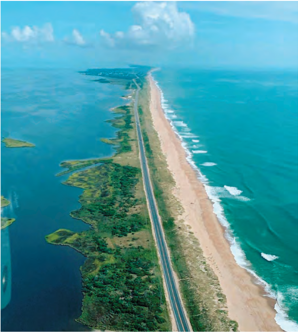
FIG. 2. Hatteras Island with Frisco in the distance.