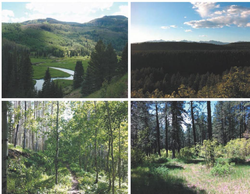
FIG. 4. Some forest types of the South San Juan Mountains. Top left: spruce-dominated subalpine forest; Top right: subalpine mixed forest; Bottom right: ponderosa-oak forest; Bottom left: aspen-dominant forest.

yet intergrading with the ponderosa pine zone, and found below and intergrading with the subalpine spruce zone. Populus tremuloides and Pseudotsuga menziesii are some of the more conspicuous tree species living in this zone, and Acer glabrum , Actaea rubra , Aquilegia elegantula , Mahonia repens and Rubus parviflorus are a few of the more common forest understory species. Populus tremuloides sometimes forms dense swaths of clonally-formed forest and can dominate large areas of elevations ranging from the upper 8000s to the lower 10000s. Truly mixed forests with codominance of many tree species ( Abies spp., Picea spp., Pinus spp. in addition to Populus tremuloides and Pseudotsuga menziesii ) are most common below ca. 10000' on the western slope yet above the ponderosa-oak forest.