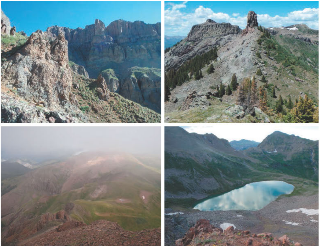
FIG. 3. Volcanic tundra adjacent to the Continental Divide.