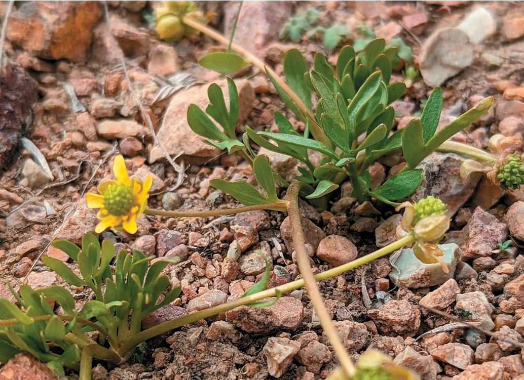
FIG. 2. Ranunculus legerae in early and mature fruit.