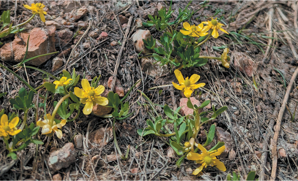
FIG. 1. Ranunculus legerae in flower.