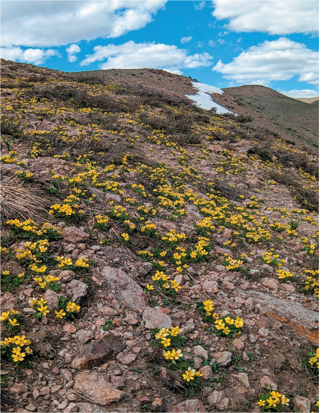
FIG. 3. Ranunculus legerae showing habitat.