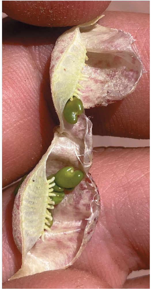
FIG. 1. Funicular flange on the inside of the pod ( Astragalus endopterus).