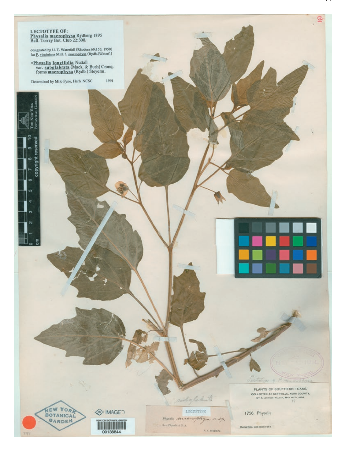
Fig. 2. Lectotype of Physalis macrophysa Rydb. Heller 1756, Kerrville, barcode NY00138844; designated and cited by Waterfall (1958).