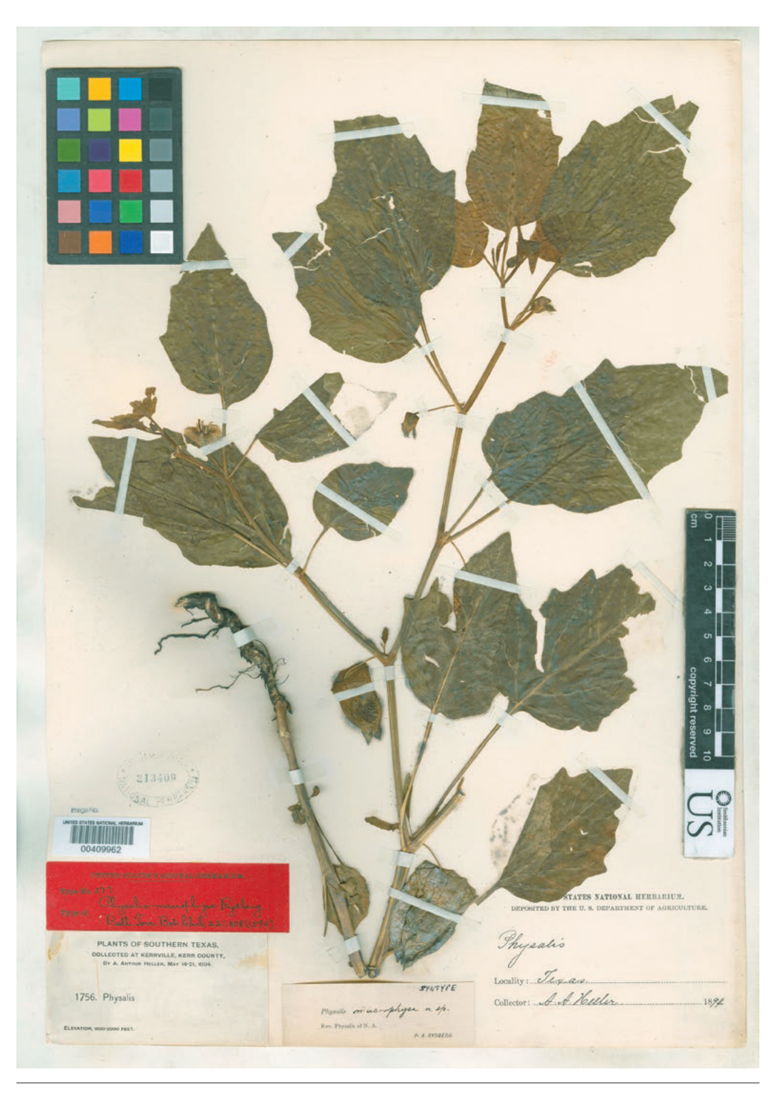
Fig. 5. Isolectotype of Physalis macrophysa Rydb. Heller 1756 , accession US213409; labeled syntype by Rydberg, not cited by Waterfall.