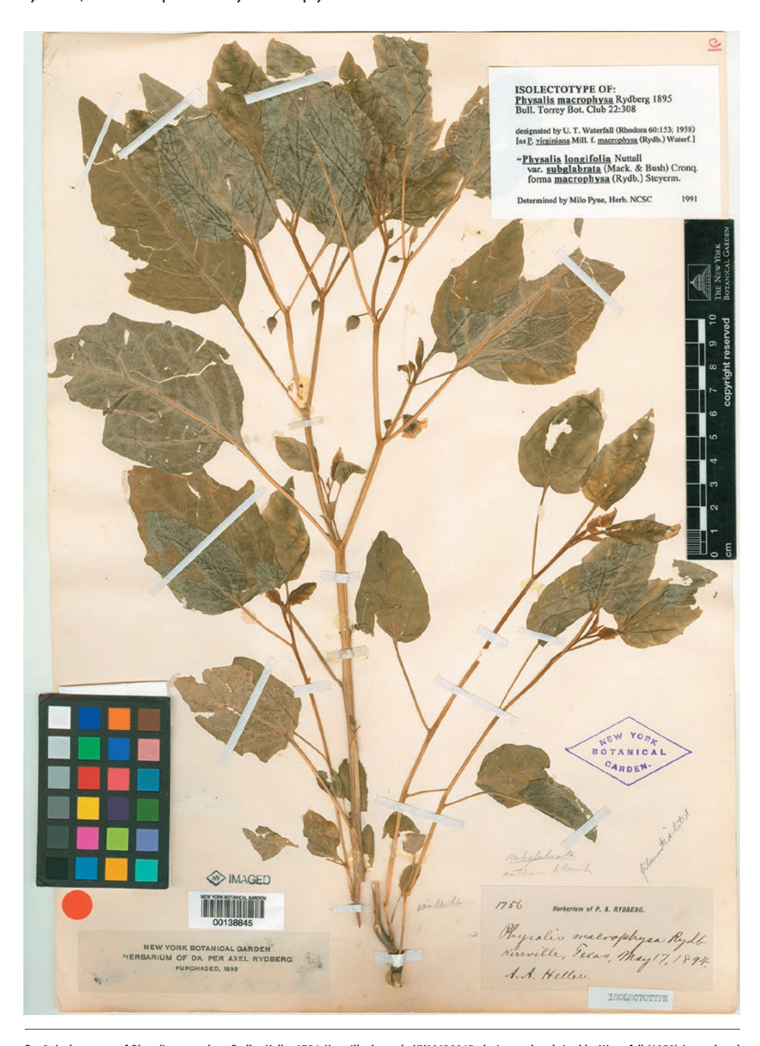
Fig. 3. Isolectotype of Physalis macrophysa Rydb., Heller 1756 , Kerrville, barcode NY00138845; designated and cited by Waterfall (1958).