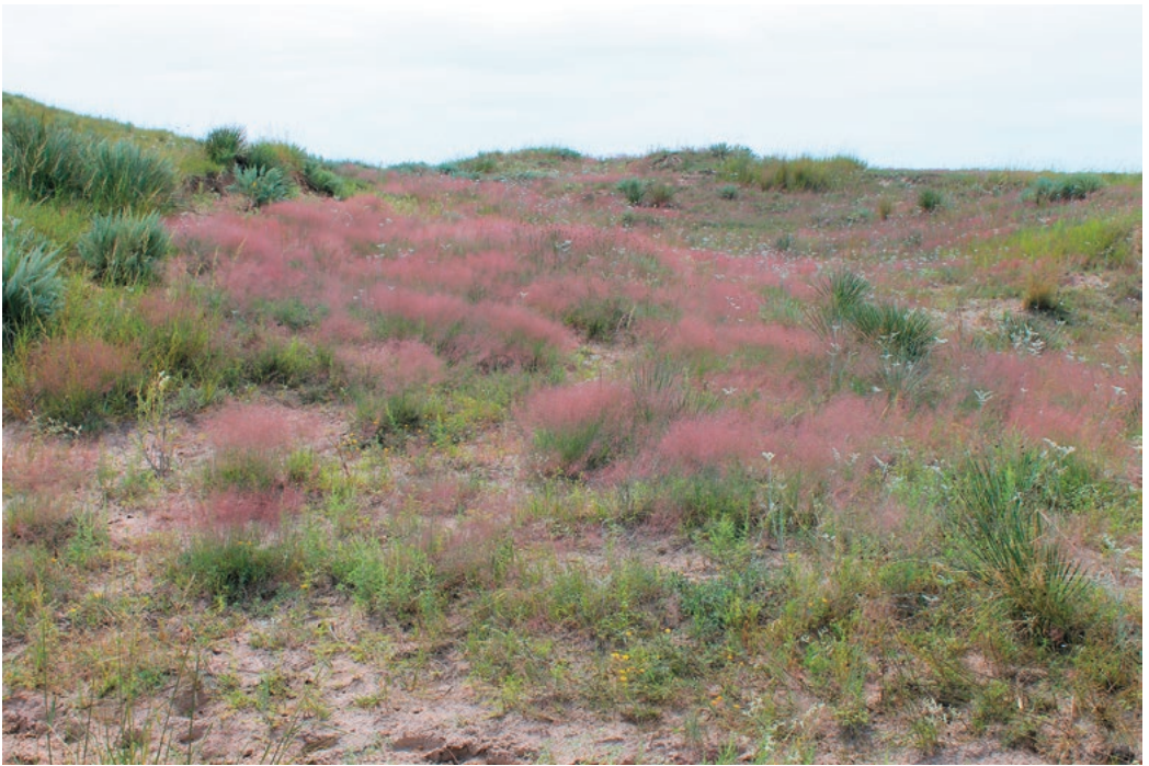
Fig. 6. Stabilizing dune sub-community dominated by Muhlenbergia pungens , Dundy County, Nebraska.

longifolia and Sporobolus cryptandrus also important (Hulett et al. 1988). The forb component is often similar to that of the surrounding shortgrass or mixed grass prairie.