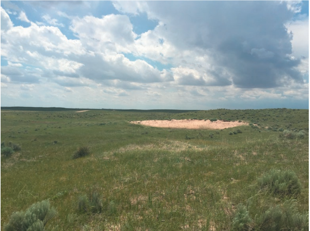
FIG. 4. Blowout in sandsage prairie, Perkins County, Nebraska.