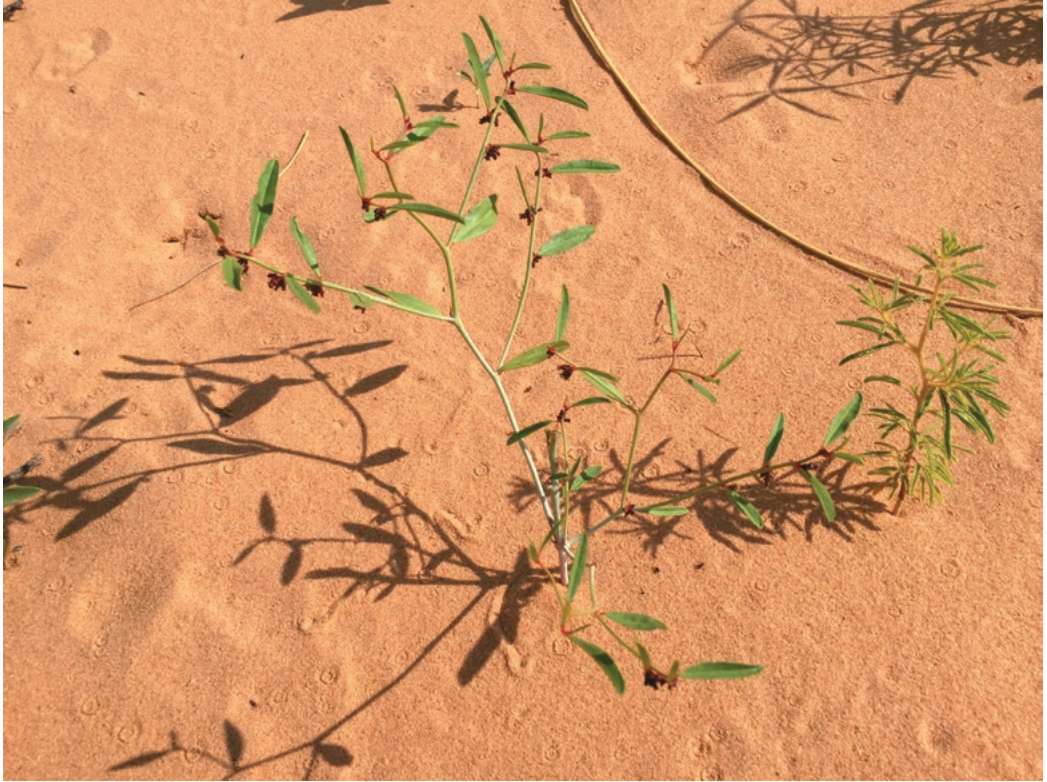
FIG. 5. Annual forbs Phyllanthus warnockii and Polanisia jamesii in open sand habitat, Woodward County, Oklahoma.

soils of the upper slopes of dunes. This habitat often supports a grass-dominated vegetation in which the shrub component of Artemisia filifolia is lacking or significantly reduced. This sub-community is the equivalent of the “Sand Prairie Community” of Ramaley (1939) and typically occurs in relatively small patches or inclusions within the overall context of sandsage prairie.