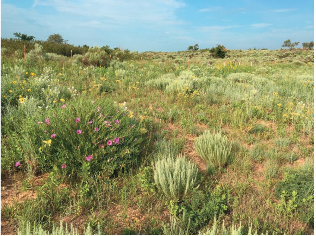
FIG. 3. Sandsage prairie, Woodward County, Oklahoma. Prominent forbs include Dimorphocarpa candicans , Helianthus petiolaris , Ipomoea leptophylla , and Oenothera rhombipetala .

co-dominate the shrub stratum. Prunus pumila var. besseyi is more prevalent in northern stands while Prunus angustifolia is limited to southern stands.