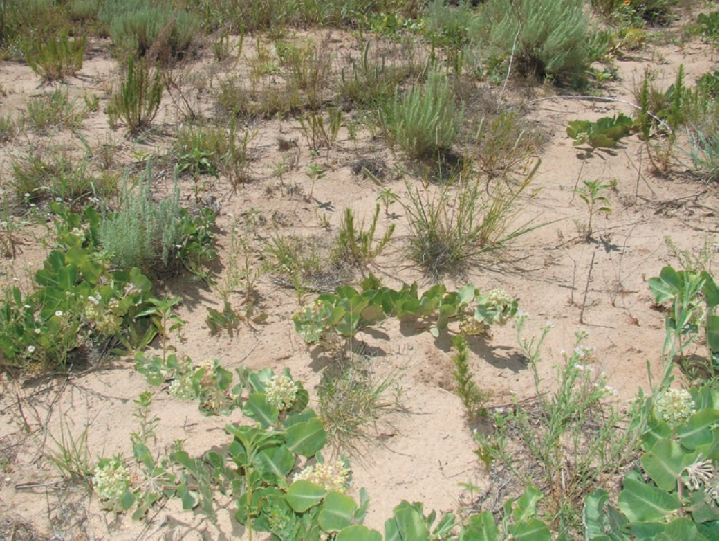
FIG. 7. Stabilizing dune sub-community, Cheyenne County, Colorado. Prominent forbs include Asclepias arenaria and Dalea cylindriceps .

occurred in interdunal valleys, swales, and depressions where the water table was close to the surface, and along riparian corridors of intermittent streams (Ramaley 1939; Hullett et al. 1988; Farrar 1993a, 1993b; Neid et al. 2007). Such areas have largely disappeared due to depletion of the regional aquifers by irrigation for crop production but historically supported a mosaic of aquatic communities and subirrigated meadow-like vegetation dominated by graminoids like Elymus smithii and Panicum virgatum .