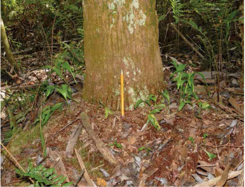
FIG. 3. A portion of a clump of over 30 plants of Ophioglossum palmatum . The clump is highly unusual, being located on a root ball at the base of a trunk of Sabal palmetto .

minimally above ground level, it contained little soil, and it encircled, and was apparently derived from, the base of a trunk of S. palmetto .