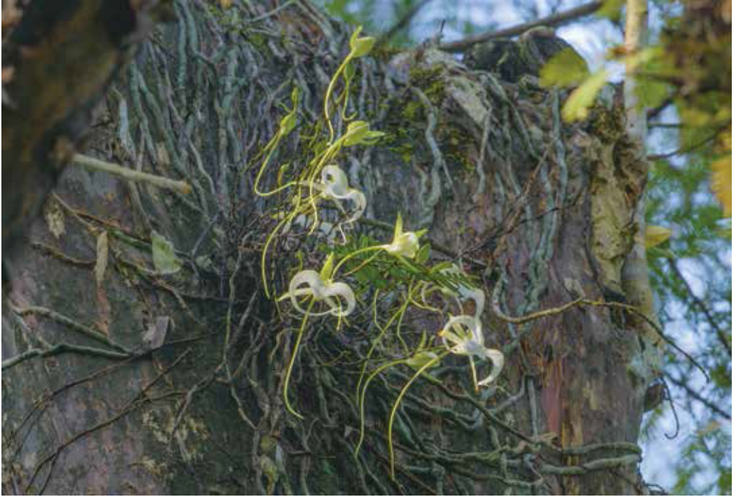
FIG. 4. An exceptionally large, profusely flowering plant of Dendrophylax lindenii , located high on a trunk of Taxodium distichum .

per year (Michael Owen, pers. comm. to George Wilder, 23 Aug 2017). (3) On 25 Jan 2015, it manifested its first flowers at anthesis for that calendar year; thereby, it set an early-flowering record for D. lindenii in south Florida. Ghost orchids in south Florida typically flower in June, July, and August. (4) The plant is situated ca. 50 to 60 feet above ground, being located higher-up than any other ghost orchid known.