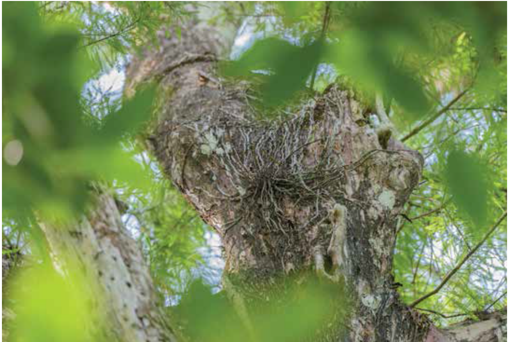
FIG. 5. The same plant of Dendrophylax lindenii as in Figure 4, lacking flowers. The plant consists primarily of roots.

anchored to a branch of Pinus elliottii which had, apparently, broken away from a tree during the Hurricane. During collection, we apparently extirpated from CSS two of the species, aforementioned (both exotic): B. javanica and C. hyalinus .