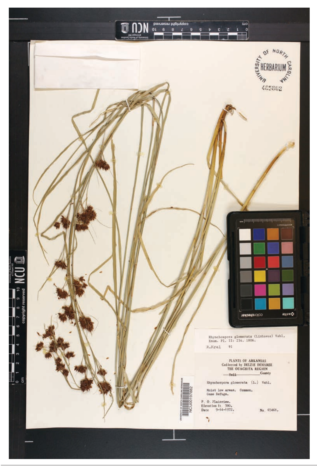
Fig. 3. Specimen of Rhynchospora glomerata from Arkansas.