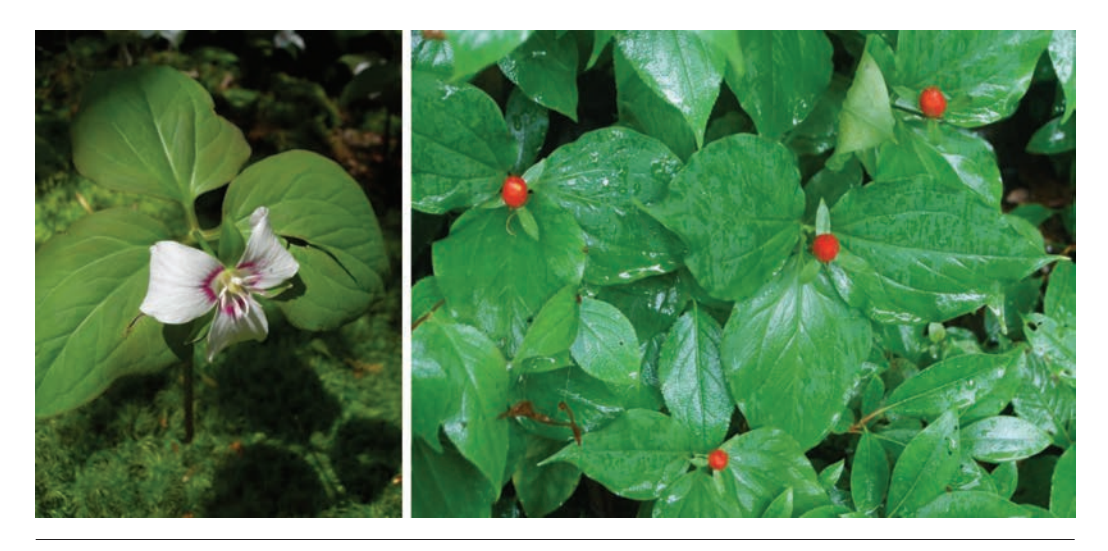
Fi6. 9. Trillidium undulatum: left, flowering in Cocke Co., Tennessee, USA showing the distinctive petiolate leaves and flowers with red-marked tepals; right, fruiting in Sevier Co., Tennessee, USA, showing the distinctive red berry-like fruits.