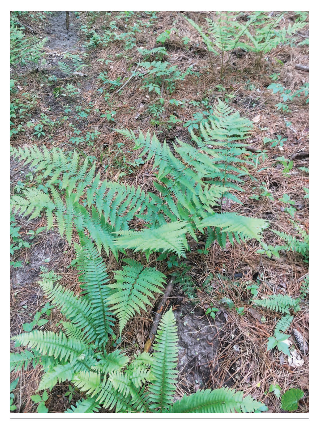
Fig. 6. Dryopteris celsa in Lincoln County, Mississippi, Other ferns present and visible include Polystichum acrostichoides and Athyrium asplenioides. 8 April 2018.