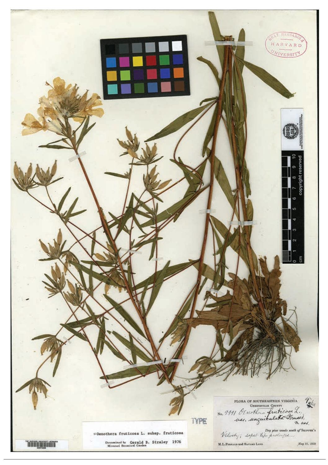
Fig. 7. Holotype of Oenothera fruticosa var. unguiculata (GH).