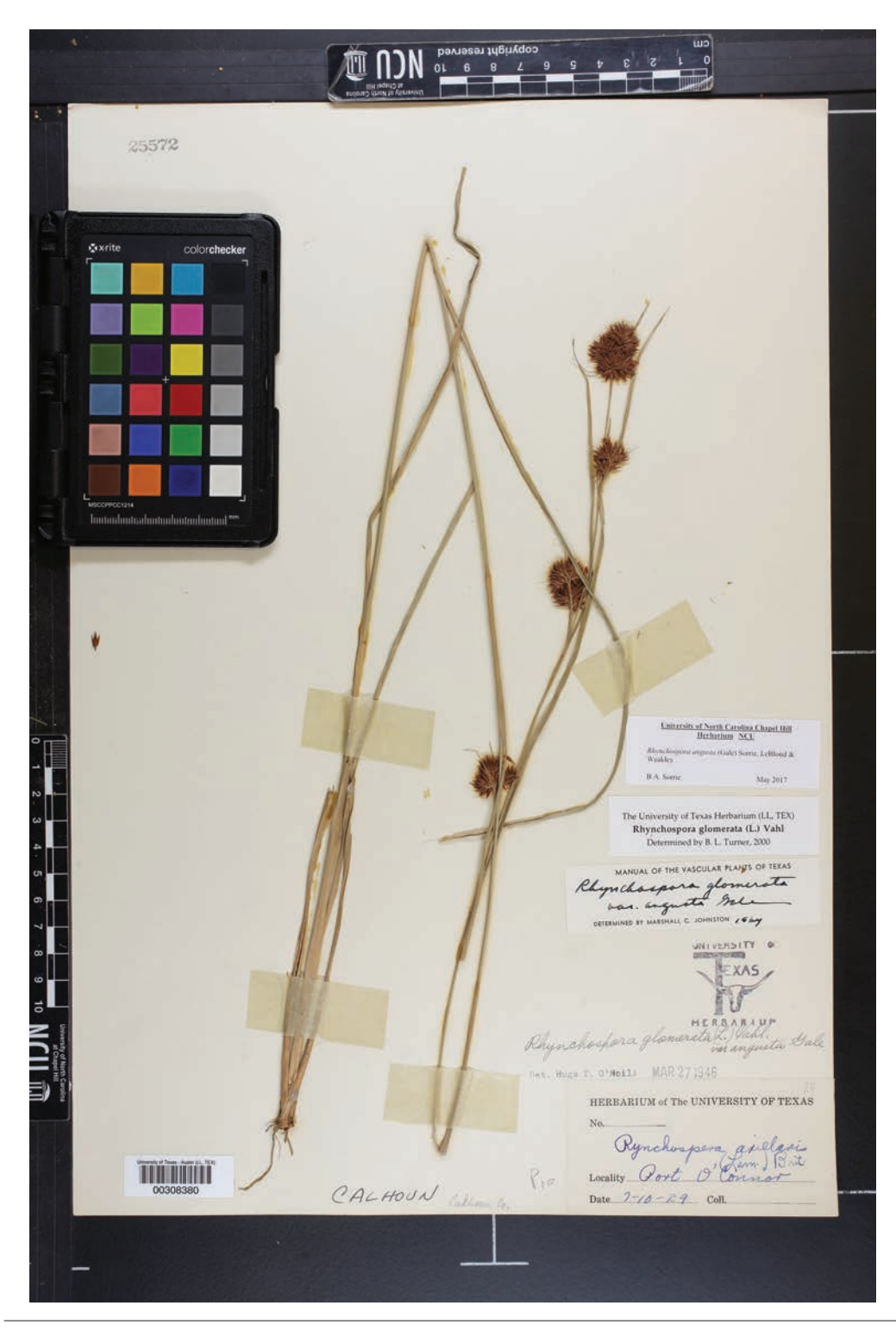
Fig. 2. Specimen of Rhynchospora angusta from Texas. Note rounded spikelet clusters and annotation in Gale's hand.