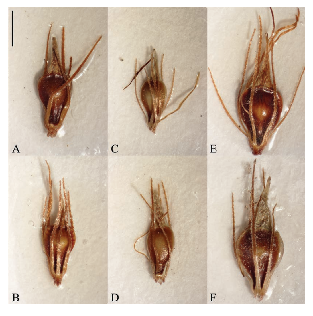
Fis. 1. Achenes of Rhynchospora glomerata var. angusta ( A–B ), R. capitellata ( C–D ), and R. glomerata var. glomerata ( E–F ). Scale bar = 1 mm. A and B are from Arkansas and Texas, respectively; C and D are from Texas and North Carolina, respectively; E and F are from Oklahoma and North Carolina, respectively.