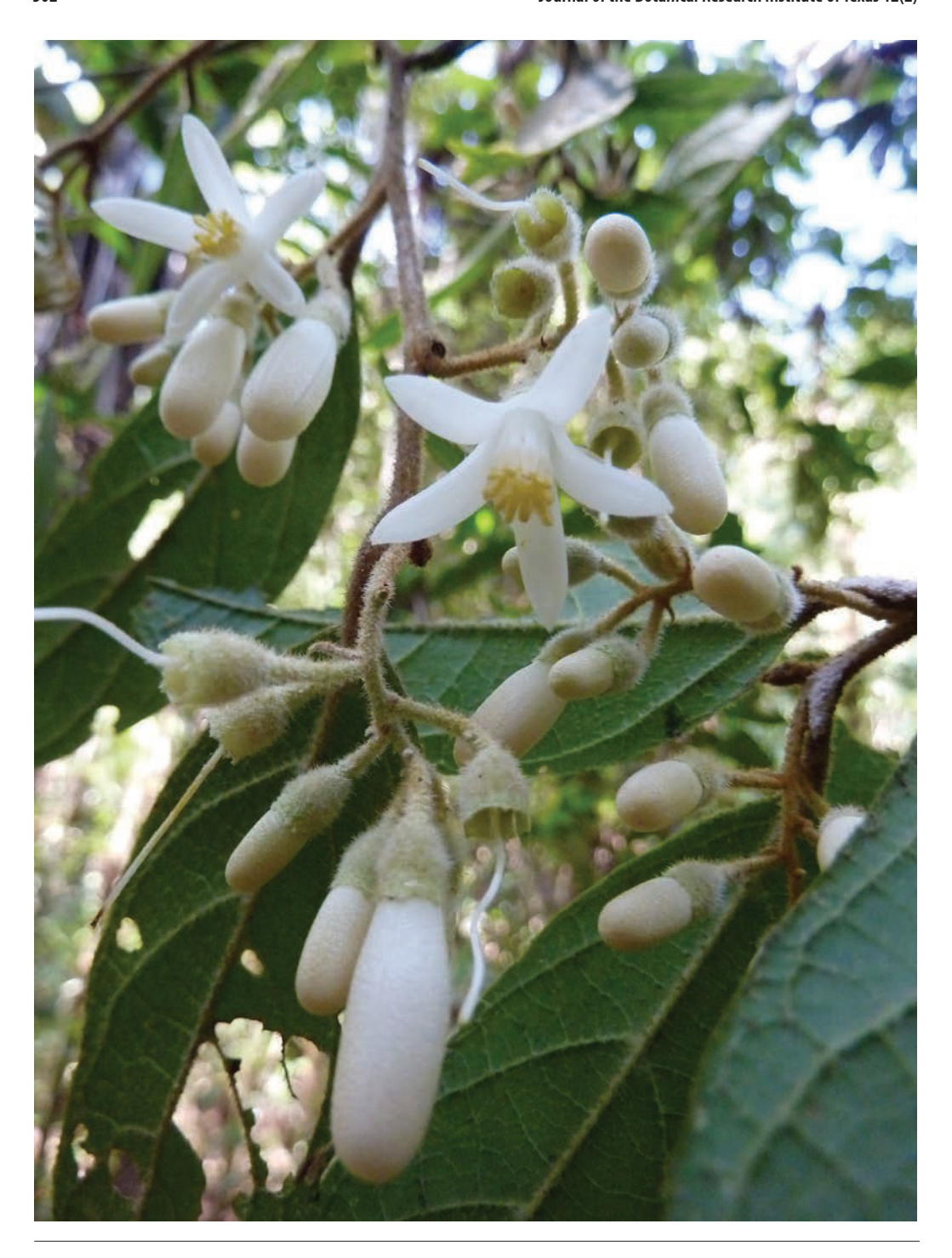
\textbf{F} \textbf{\tiny{IG.}}~\textbf{2.}~\textbf{Flowering branchlet}~\textbf{of}~\textbf{\textit{Styrax paulhousei}}.~\textbf{Photo by Sr.}~\textbf{F.}~\textbf{Fernandez}.