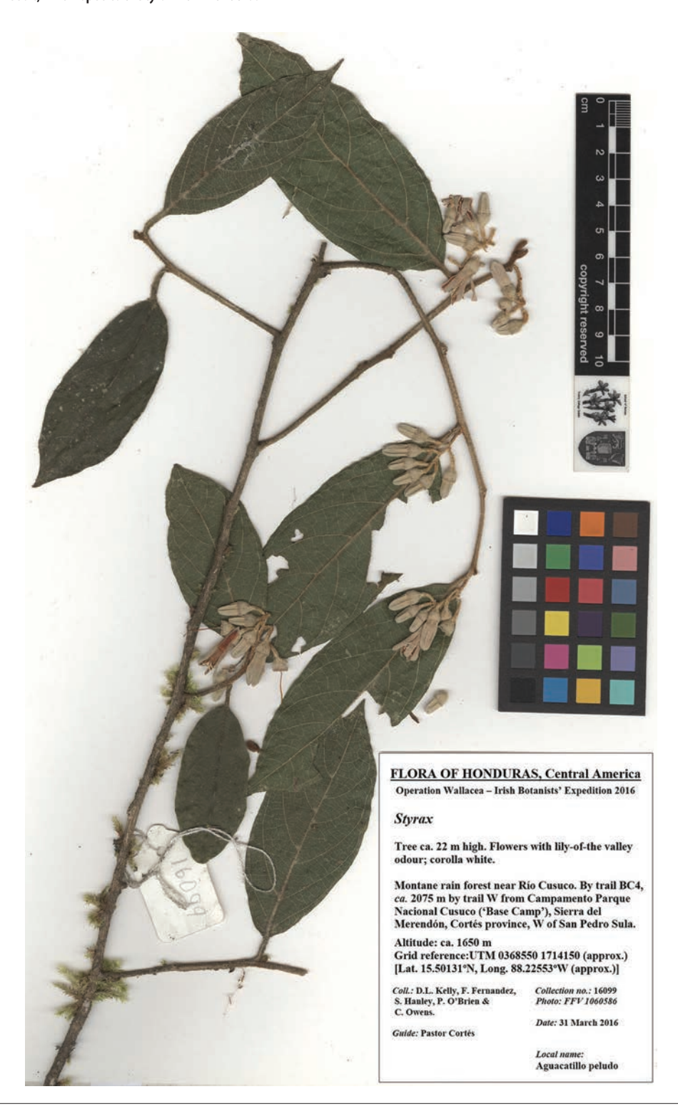
Fig. 3. Image of unmounted holotype specimen of Styrax paulhousei (TEFH).